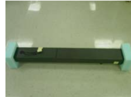
Remove Pedestal Assembly