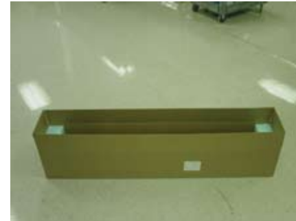
Open Pedestal Box