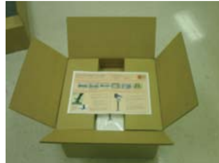
Open Display Box